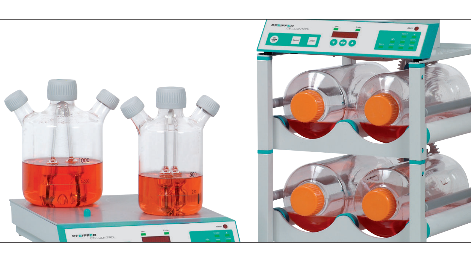
CELLROLL and CELLSPIN Cell cultivation system that grows with your needs